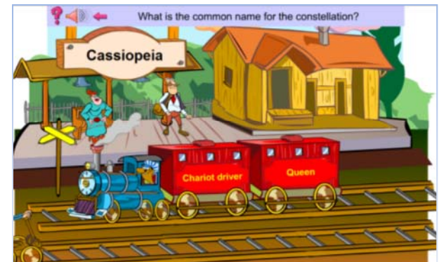
Science – screen shot of What's Proper? What's Common? a game on constellations