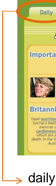
Screen Shot - July 13, 2009