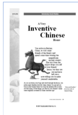
Social Studies – An Inventive Chinese Home