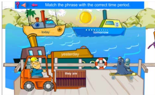
English and Language Arts – screen shot of Yesterday, Today and Tomorrow